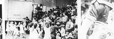
The Nicholas County Lady Jackets celebrated at Tracks Restaurant on Saturday night after the Lady Jackets won the All "A" 10th Regional Classic Tournament.