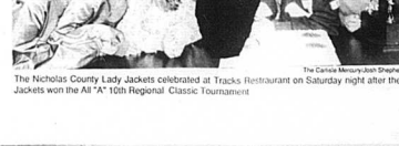
The Nicholas County Lady Jackets celebrated at Tracks Restaurant on Saturday night after the Lady Jackets won the All "A" 10th Regional Classic Tournament.