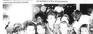
The Nicholas County Lady Jackets celebrated at Tracks Restaurant on Saturday night after the Lady Jackets won the All "A" 10th Regional Classic Tournament.