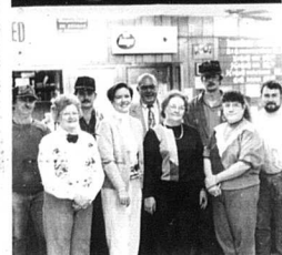
Featured are the employees of Reid & Vice, Inc. one of the businesses featured in Red Carpet Days

Reid & Vice, Inc. has been serving Carlisle for 30 years