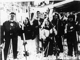
The Catholic Menorah Light