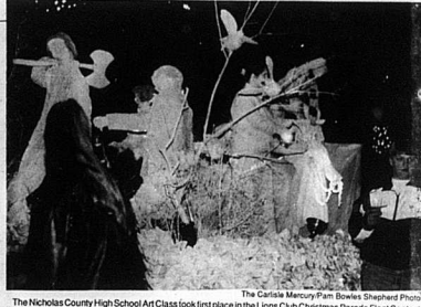
The Nicholas County High School Art Class took first place in the Lions Club Christmas Parade Float Contest Saturday night.