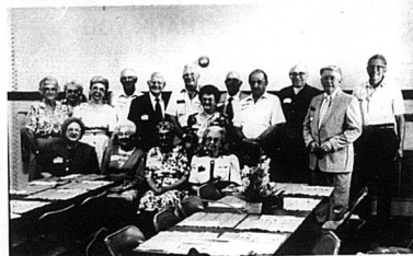
The graduates of the Carlisle High School class of 1942 celebrated their 50th reunion at the Carlisle Depot Saturday morning and enjoyed the return of most of its former class members. The class of 42 were less than 10 years old when the above class left for school to enter the Great Depression. But their class was no less an historic maker. The United States was fully engaged by World War II when they accepted their diplomas.

Pride Fried Chicken 2 pc. $3.99 Marinated and lightly breaded in our special herbs and spices. Served with your choice of potato and cole slaw