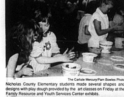
Nicholas County Elementary students made several shapes and designs with play dough provided by the art classes on Friday at the Family Resource and Youth Services Center exhibit.