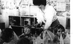
The Carlisle Mercury Pan-Book Photos