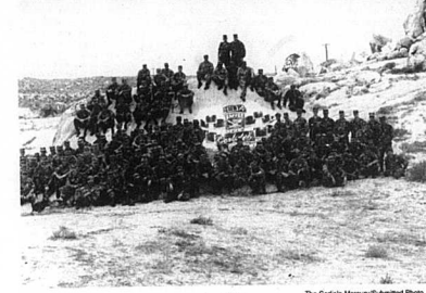
The National Guard and Reserve Unit Company D Engineering Unit in Carlisle has returned from training maneuvers in California.