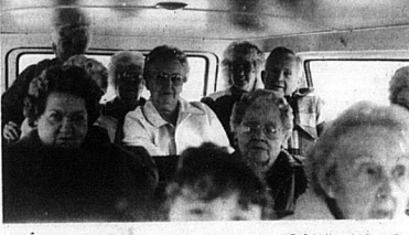
Above and below: Nicholas County senior citizens climbed aboard the Community Action Transportation buses for a weekend of fun and good country music at Kentucky's famous home for bluegrass and country, Hettie Valley. Two buses were needed to transport the Nicholas County citizens who are apparently very excited about the trip.