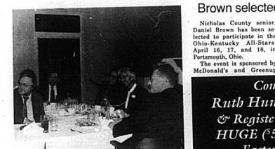
Carlisle-Nicholas County Chamber of Commerce Directors treated the doctors and dentists of the community to a dinner at the 19th Hole of Camico on Monday night. The dinner was to celebrate doctors appreciation day.