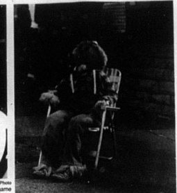
The International Rainbow Girls held a bake sale and called on the services of a scarecrow for his assistance.