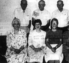
The 1931 graduating class of the Old Carlisle High School celebrated their 60th anniversary on Saturday, Sept. 14, 1991 at the Carlisle High School.