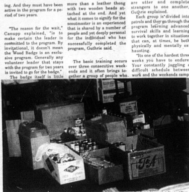
Nicholas County Scouts held their canned food drive last weekend and collected several boxes from donors all over the Carlisle area. With the aid of the Nicholas County Senior Citizens center, these cans were donated to the Community Action Center to provide food for needy families in Nicholas County.