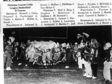
The Cardinals and the Rockets squared off Saturday afternoon in Little League action.