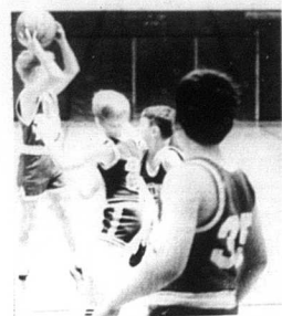
The Patriots and the Rockets squared off Saturday afternoon in Little League action.