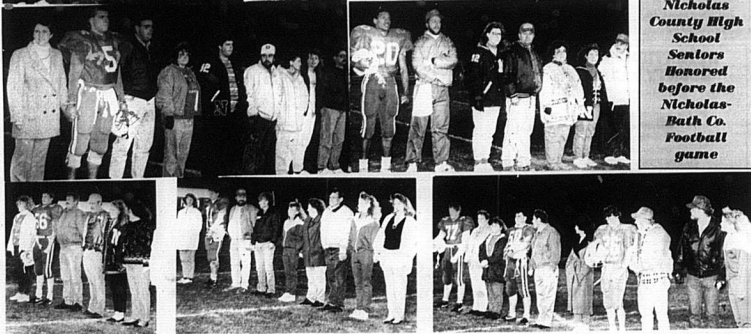
Nicholas County High School Seniors Honored before the Nicholas-Bath Co. Football game

Laytard's Grocery 181 Myers Rd. 289-7434