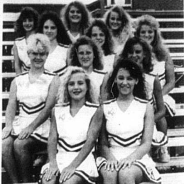
1991 Nicholas County Football Cheerleaders