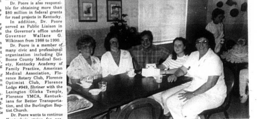
The Carlsle Mercury Staff, 1000 ... Reception at the Johnson Matthers cafeteria to celebrate National Hospital and Nursing School. Celebrations were held all week from balloon lift on Monday...