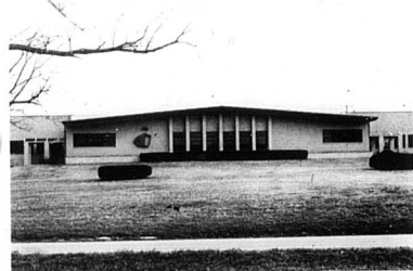
JOCKEY INTERNATIONAL, INC.