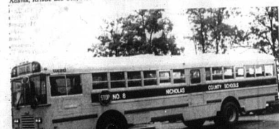
This large, non-traditional looking school bus was delivered to Nicholas County Schools after the end of school it will be in service for the coming school year.