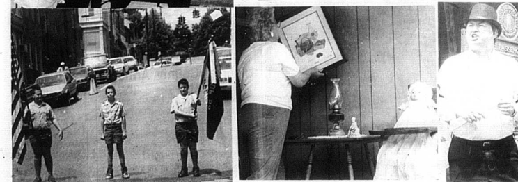
The Central Kentucky Railroad and the Bicentennial Commission sponsored two days of events in Carlisle, July 13-14. Both days a restored steam locomotive made its way to Carlisle with passengers from Paris. Many local residents participated in the Carlisle portion of the festivities. The Old Nicholas County Jail was open to tourists, with other activities at the Carlisle Depot.