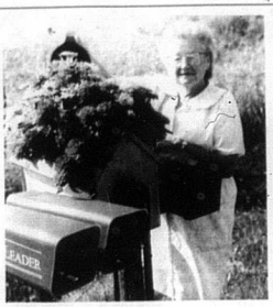
Dressing up for the mail . . .

Hopkins Drug Co. Main St. Carlisle 289-2274