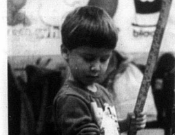
Members of the Carlisle Community Center are shown at a meeting...