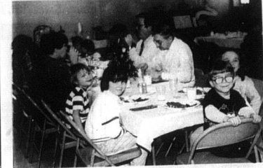
The First Christian Church entertained children from the elementary school last week for a Christmas dinner.