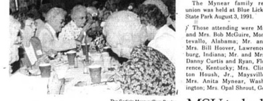
The members and their guests enjoyed the Carlisle Alumni Banquet dinner on Saturday night at the Worthington.