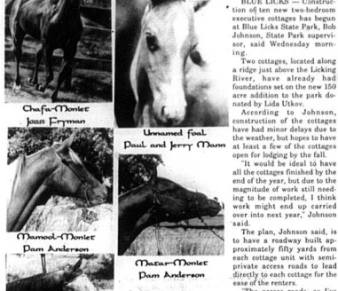
Paddy is a natural yearling above the Licking River, has already had foundations set on the new 150 acre addition to the existing park, including the Pigeon Forge Paralel. It was 1989 SAHBA Reserve Champion.