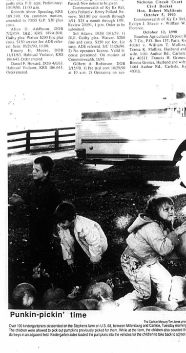
Punkin'-pickin' time Over 100 kindergarten children on the Stephens farm on U.S. 68, between Millersburg and Carlisle, Tuesday morning. The children were allowed to pick out pumpkins previously picked for them. While at the farm, the children also toured the donkeys in an adjacent field. Kindergarten aides loaded the pumpkins into the vehicles for the children to take back to school.