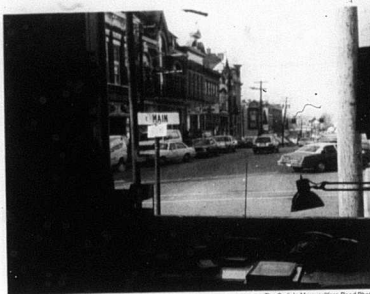
The department moved into the office two weeks ago.