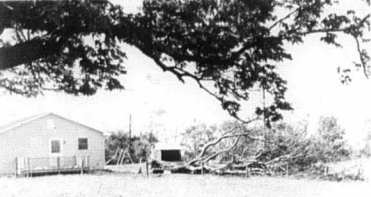
Severe weather ripped through Nicholas County last week, uprooting trees and damaging property. These pictures are from Morefield Road. Two were sent to Nicholas County Hospital following an apparent tornado, which destroyed a trailer.

When the skies look threatening listen to the radio. The National Weather Service and the Severe Storm Warning Center track all weather systems with sophisticated radar and are usually able to give adequate advance warning of violent weather conditions. A tornado watch means that atmospheric conditions are such that tornadoes could develop. A tornado warning means an actual funnel has been sighted in your area. Warnings are usually accompanied with a description of the speed and direction of travel of the funnel. When a watch is issued, listen to broadcast advisories, and be ready to take cover. Turn on bright headlights and radio and have family members within earshot under watch conditions. Also, take your car keys; you can still be operated in the rubble. Immediate action saves lives. When a tornado threatens, immediate action can save lives. Stay away from windows, doors, outside walls and protect your head. In homes or small buildings, go to the basement or a place in the middle of the house, like a closet, bathroom or interior wall. Get under something sturdy. In school, lie calm and follow the directions of your teacher. Stay away from multi-story buildings. If there isn't any a small hallway or under a table. By thinking clearly and calmly and helping one another, Kentuckians can limit the injury and destruction tornadoes cause.