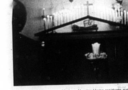
42 residents who have passed away in the home week May 13-16.