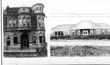
The Carlisle County Courthouse