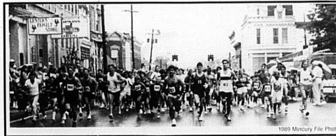
1989 Mercury File Photo

The 5000 will get underway at 8 a.m., with the start and finish in front of the Nicholas County Courthouse. The 2.1 mile course is listed as flat and level. There are several age groups for both male and female and all pre-registered participants will receive a shirt. Other participants will receive shirts on an available basis. Race forms are available from Pie-Pac, Jewelry Patch or Farm Credit, and in The Mercury. For information call, 618-2686, 289-2228, 289-5765 or 289-7460.