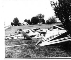
For the second straight week bad weather brought destruction to many areas in Nicholas County. Especially hard hit were the Moorefield and Moorefield Road areas.

High water struck many places across Nicholas County early Sunday morning as rain from several severe thunderstorms caused creeks to overflow and brought damage that cost thousands of dollars throughout the county. Severe thunderstorms and tornadoes washed for every section of Kentucky occupied the majority of late Saturday evening and early Sunday morning weather.