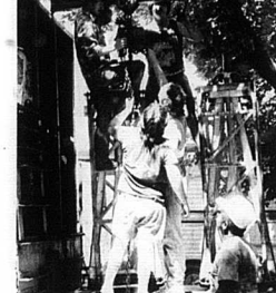
Workers make ready for rides and other events on the courthouse lawn during the 1990 Blackberry Festival.

Slaughter Bulk: Yield Grade No. 1 1280-2010 lbs. indicating 80-83 carcass boning percent... Slaughter Calves: few Good and Choice 305-430 lbs. 82.00-94.00.