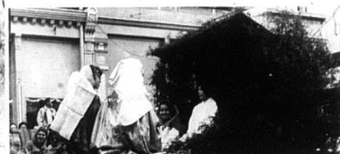
Children from Our Lady of Guadalupe depict a manger scene for the Christmas parade. The float placed third in the float contest.