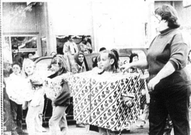
Members of the Nicholas County Girl Scouts marched along with the Christmas parade dressed as Christmas pack-agers.