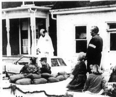
The Carlisle Mercury/Ala These Photo First National Bank of Carlisle won first place in the float contest with this entry. The float had a theme of a family praying for soldiers in the Middle East.