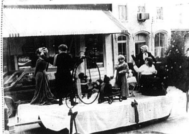
The Carlisle/Nicholas County Tourism Inc. float won second place in the float contest. The float portrayed an old-fashioned Christmas.