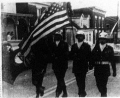
Representatives of the Carlisle National Guard led the Nicholas County Lion's Club Christmas Parade with the United States and Kentucky flags. The parade was held last Saturday at 8 a.m. in the town square. The Nicholas County High School band, Girl Scouts, Boy Scouts, Nicholas County Little League players and cheerleaders, a float contest, the Snow Queens contest and Snowflake Princess contest