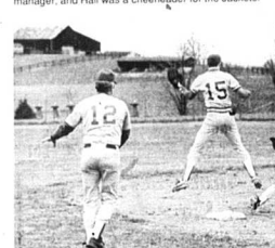
Nicholas County to do little to stop powerhouse Rowan County last Wednesday at NCHS field. The Vikings rolled to a 12-0 decision, as NCHS dropped to 1-1 on the year.