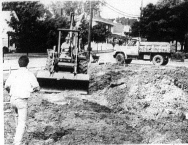
Mended Walls . . . The courthouse wall from the corner of Locust Street along Main Street has been carefully dismantled and rebuilt straight again. The work, funded by the Nicholas County Fiscal Court, was finished two weeks ago.