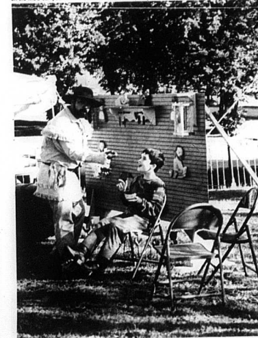
One character takes Chautauqua days in Millersburg at its word. The two day event, held in the park in the center of downtown Millersburg, featured dancing from the Bourbonite Cloggers as well as refreshments and antique and furniture booths.