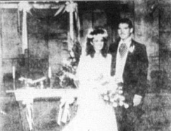
The bride was late ever satin featuring a stallion neckline and short, puffed sleeves. She carried a cascade of white roses, baby's breath, freesia and stephanotis on a background of greenery.