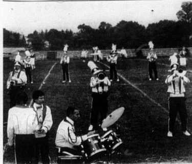
The Nicholas County High School Marching Band took several first place awards in the Mason County Band Contest last weekend, including a first place award in their division. Other awards included best field commander, best flag corps, as well as a tie with Bethel for best percussion.