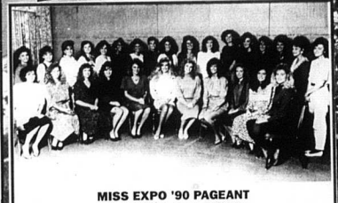
MISS EXPO '90 PAGEANT