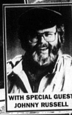
WITH SPECIAL GUEST JOHNNY RUSSELL