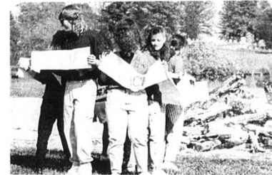
High School students throw paper strips with the various names of illicit drugs into a bonfire to celebrate Rip It Down Day, the state wide anti drug demonstration held at most of the county schools in Kentucky.