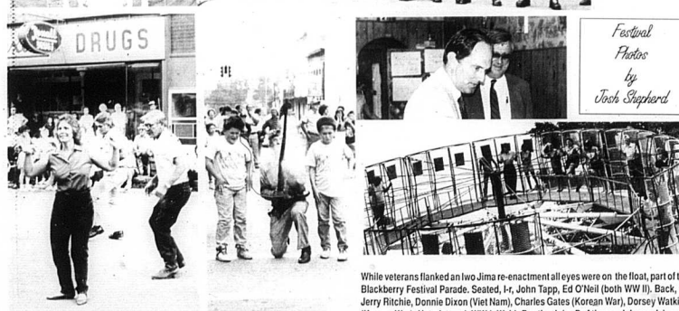
Festival