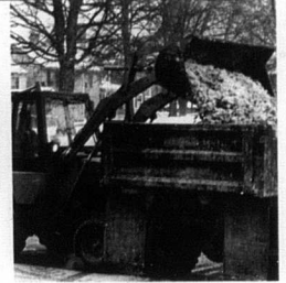
Clearing it away

Snowfall last week kept city employees busy clearing roads. Above left, a city employee clears snow from side-walks along Main Street, while a backhoe and dump truck are used to load snow and haul it away. The wintery weather made work difficult for some public service workers, causing slick roads and freezing water lines. For a related story, see page 1.