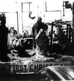
(Bottom Left) The First National Bank took first place with its float. (Bottom Right) The second place float in the parade, sponsored by the Nicholas County Lion's Club, depicted the nativity scene of the birth of Jesus Christ.