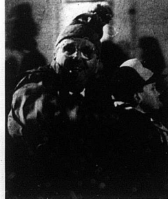
Kentucky Sixth District U.S. Congressman Larry Hopkins was the grand marshal of the 1989 Carlisle Christmas parade. Along with some companions, Hopkins greeted residents and distributed candy.