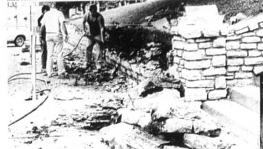
Workers for Donald Robinson Masonry take apart the Nicholas County Courthouse creek stone wall facing Main Street to straighten the wall foundation. Workers are saving most of the creek stone to be used to piece the wall together again after work on the foundation is finished.