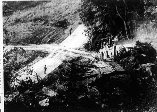
Construction has begun on a new bridge to replace the Licking River bridge on Myers Station Road (KY 32). Plans call for the hill above to be leveled and the bottom near the Licking River to be raised. The Federal project has been planned for three years and is slated to be completed by the spring of 1990. — See additional photo on page 15.