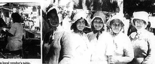
One woman seems to express delight at a "flea" on a local vendor's table. Behind her some lamp trading is going on.