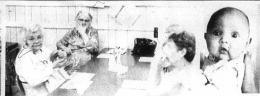
Waiting for the games to begin, one activity that could still be enjoyed during Saturday's rain. One of the many participants in the Baby Contest held in the Court House