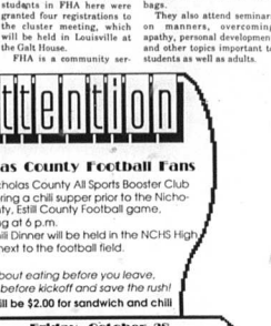
Don't worry about eating before you leave home, join us before kickoff and save the rush! Cost will be $2.00 for sandwich and chili.

The Nicholas County All Sports Booster Club is sponsoring a child supporter for the Nicholas County, Estill County Football game, beginning at 6 p.m.