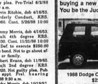
1988 Dodge Caravan, Stock #6108 for only $223.25* per month.