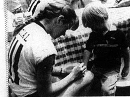
Giving "finger painting" a new meaning is this professional at the Jockey International Hee Haw Family Day picnic.