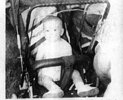
"Women's lookie's" awfully hungry. Mom's at the Jockey International Inc. Hee Haw Family Day picnic.