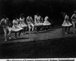
The Gateway Cloggers entertained Jockey International Inc. employees and guests with two shows Saturday.