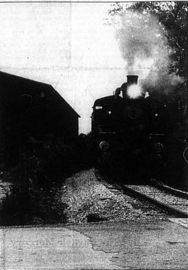
Engine 153, owned by the Kentucky Railway Museum makes one of many trips through Nicholas County. Additional passenger trips will be available May 28-30 from Maysville to Paris, with no stop in Carlisle. And, from Maysville to Louisville, May 31, with a stop in Carlisle.

The group is also asking for donations toward the group's project, which can be made during the weekend event. The association's goal is to perpetuate the memory of Carlisle High School, the old school ground, the ballgames and all that surrounds a high school, filled with the voices of young people. The association's plan is to keep the memories alive as long as possible.